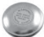
Original 1932-48 Gas Cap